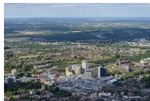
Basingstoke – Town