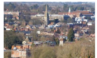
Winchester – City