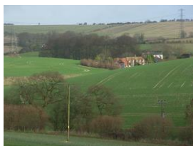
Hare Warren - Hamlet

Basingstoke is in Hampshire. The county of Hampshire is surrounded by Dorset, Wiltshire, Berkshire, Surrey and West Sussex.