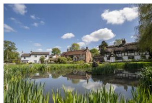
Oakley – Village